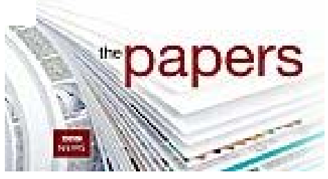
The papers: Monday's front pages