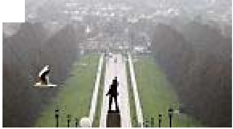
N Ireland broad agreement brokered