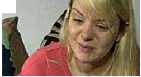
Grieving mum's distress at burglary