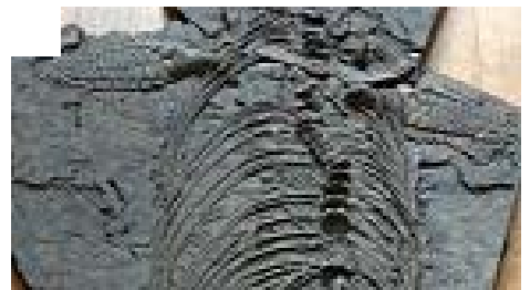
'Whopper' unearthed by fossil hunter